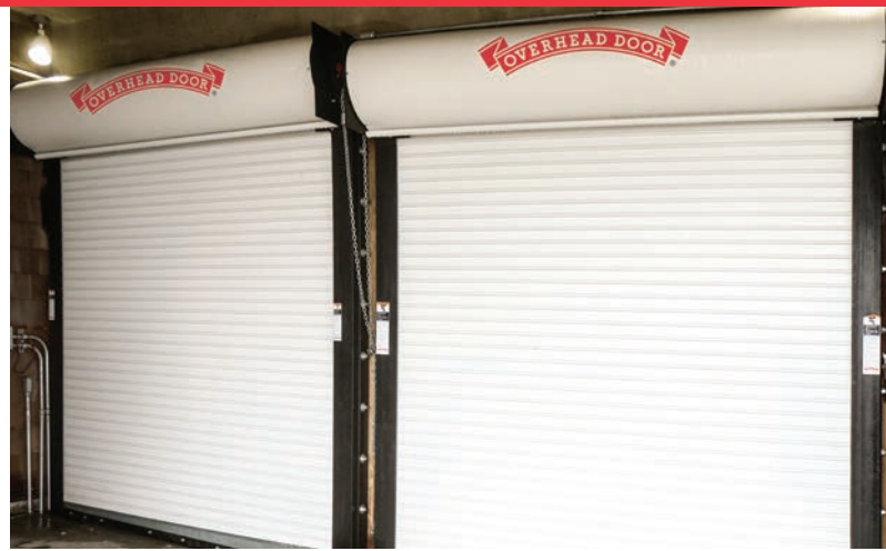
White finish. Installation and service: Overhead Door Company of Concord™

When overall performance and thermal efficiency are as essential in a rolling service door as are versatile good looks, the Stormtite™ 625 meets specification and exceeds all expectations. This heavy-duty door features insulated slats in a variety of materials – galvanized steel, stainless steel or aluminum – and offers optional wind load protection up to 170 psf. Designed to fit openings up to 30'4" wide and 28'4" high (9246 mm x 8636 mm) and offered with a broad range of product options, the versatility and functionality of the Stormtite™ 625 ensures that your design requirements will be met with ease, functionality and style.